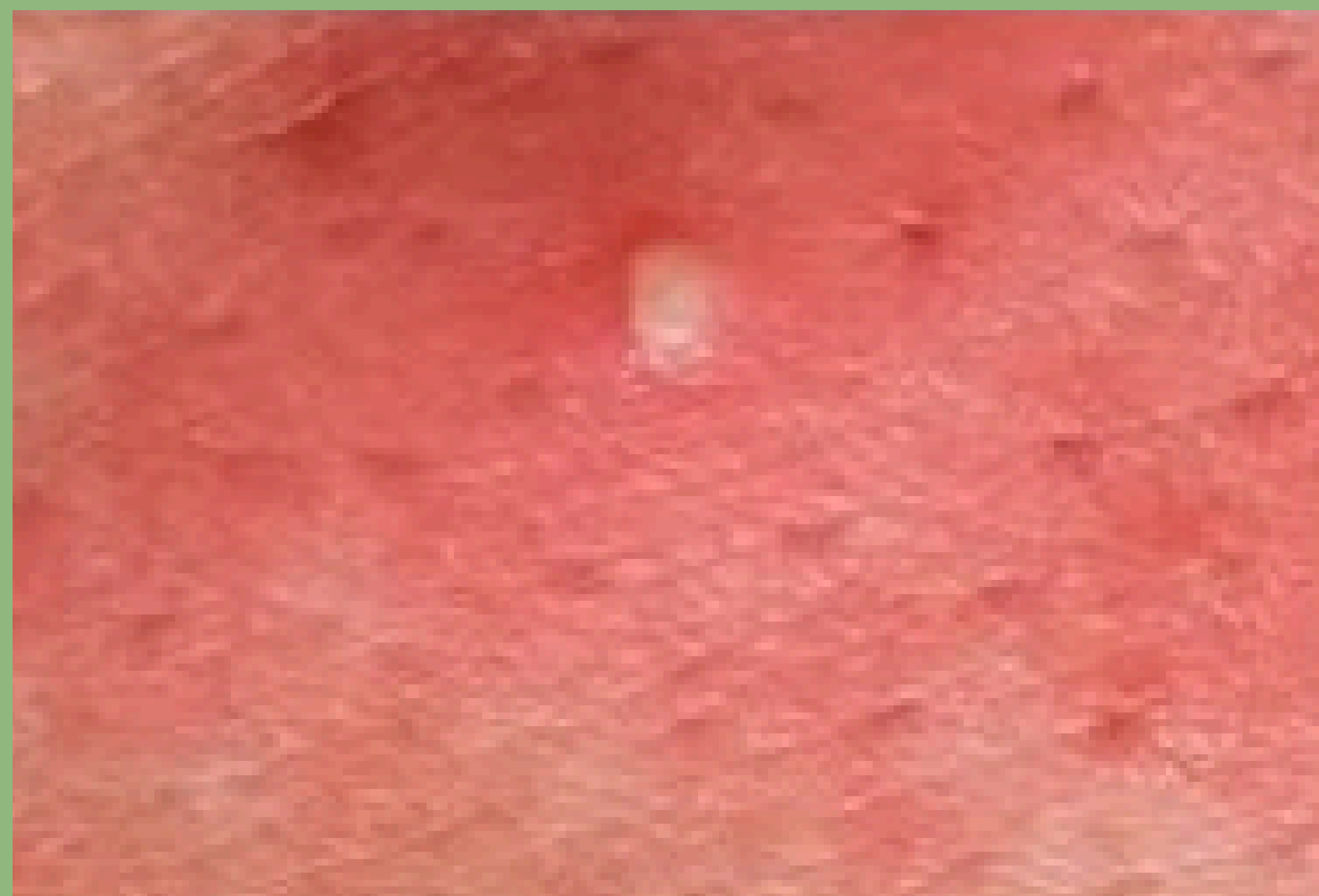
Stage 3: Vesicle.

The bumps get larger. They look like fluid-filled blisters (1-2Days).