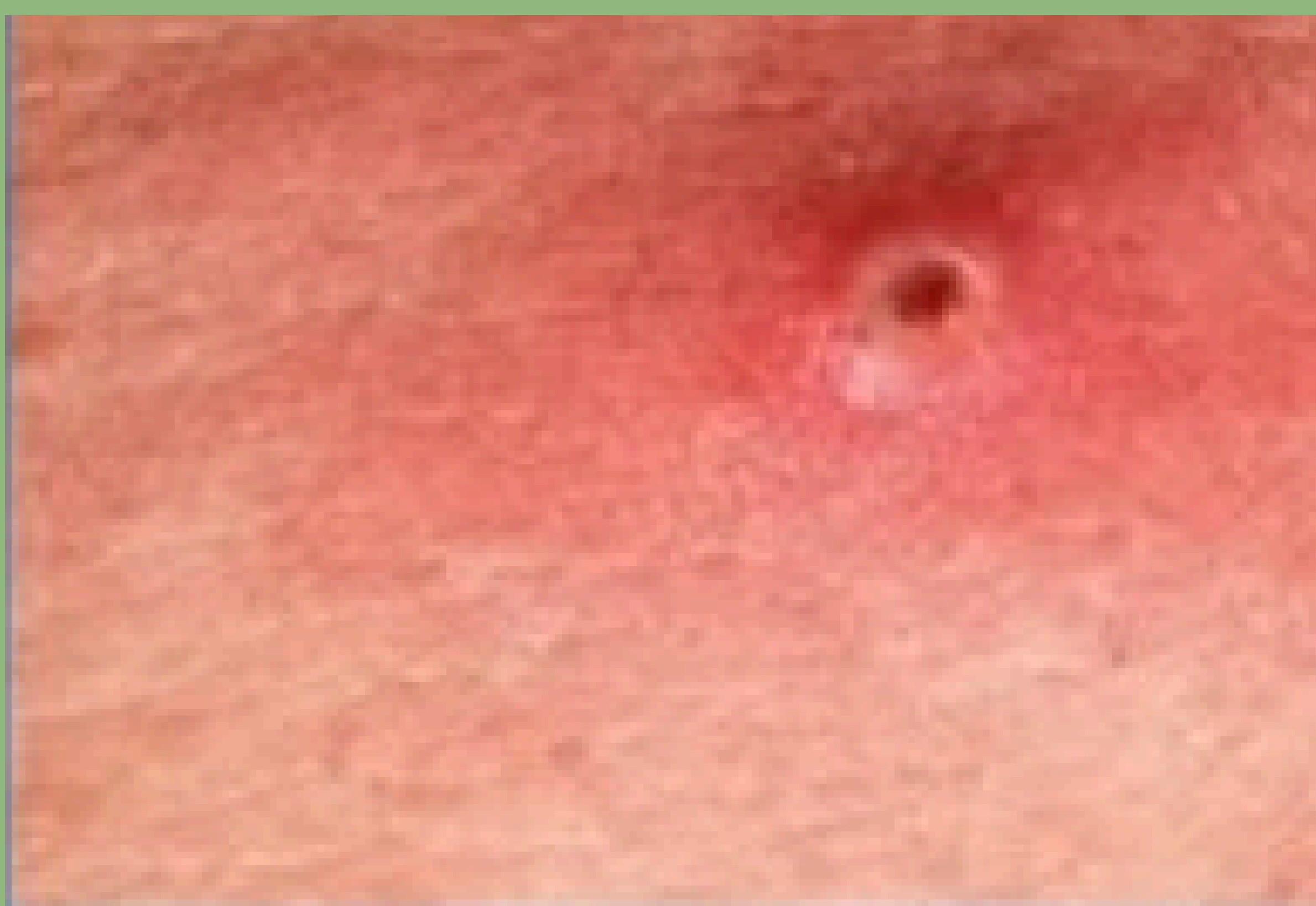
Stage 4: pustule.

The blisters fill with pus (Lasts 5-7 days).