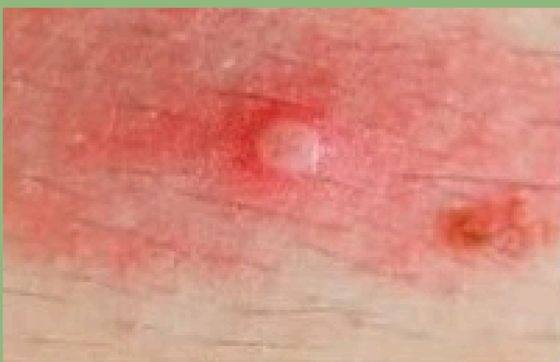
Stage 2: Papule.

The spots become hard, raised bumps(1-2 days)