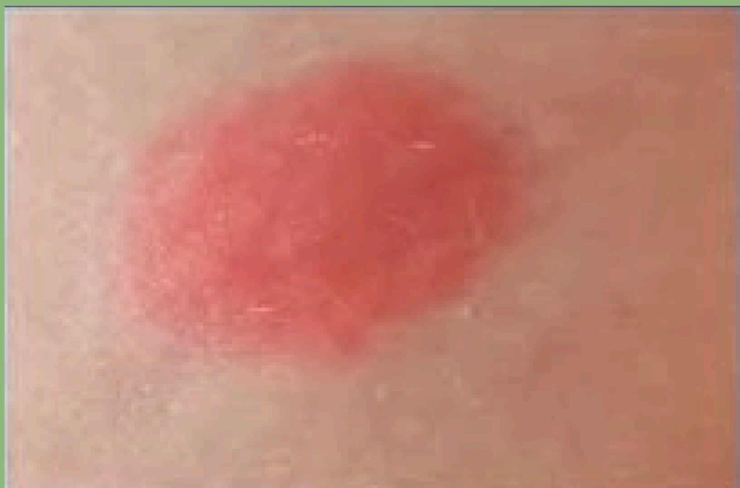
Stage 1" Macule "

The rash starts as flat, red spots (Lasts 1-2 days)